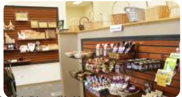
Florida's Disney World.

Gunfighter Kids' Gym: Our giant indoor playground has five slides and plenty of climbing sections to play on and explore. For the toddlers, there is a dedicated area to play with age appropriate equipment. Ask about our punch card! We also have a party room available for special events!