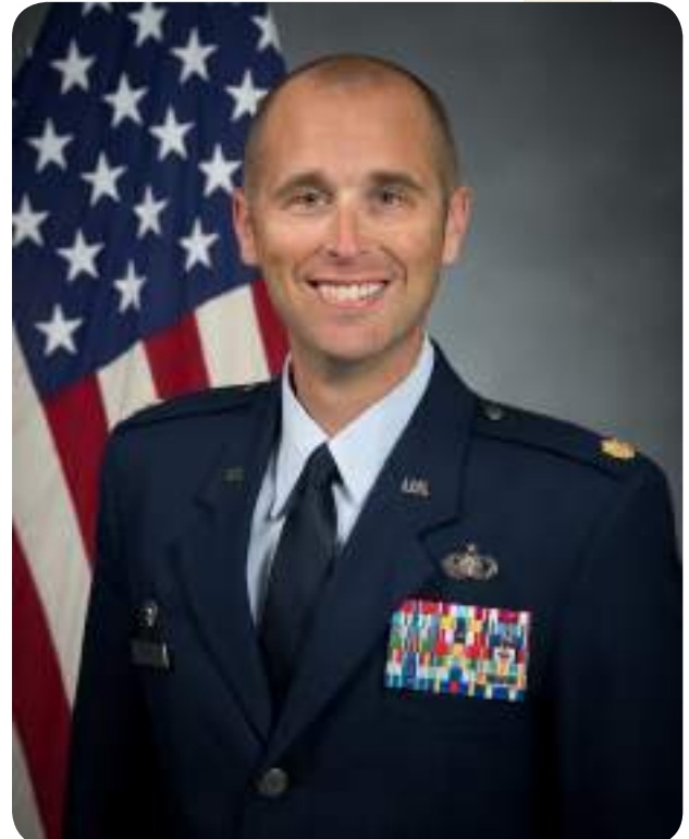
NATHANIEL A. WHITE, Major, USAF Commander, 366th Force Support Squadron

I hope you've arrived with a big sense of adventure, because our team of support professionals are ready to set your western experience in motion! Congratulations on your assignment to Mountain Home Air Force Base, I'm certain, with our programs, this will be the best assignment in your Air Force career. Who's the best? FSS!